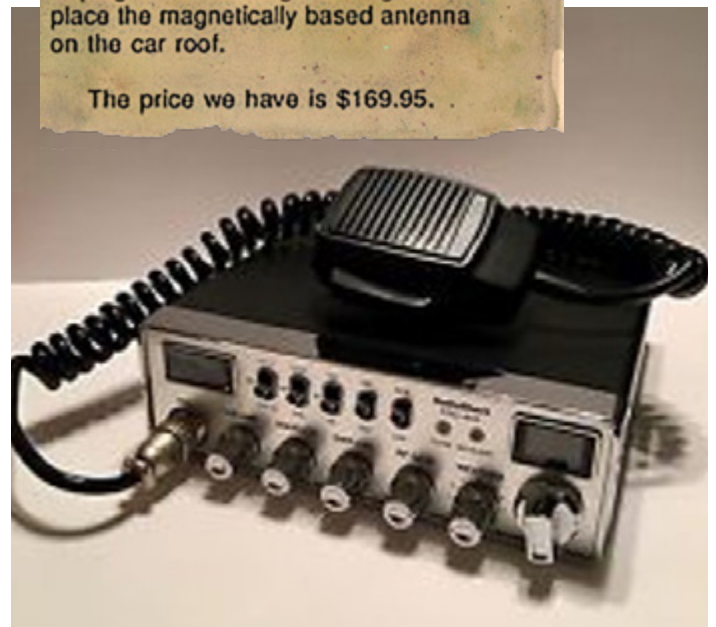
The original article from Newslink 1987, and an old CB Radio