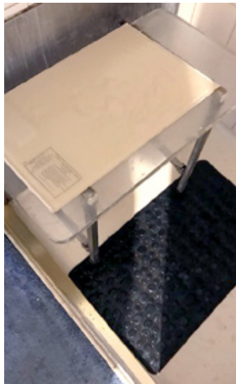
The scene of the crime.

I have always loved jumping on my shower seat at home to have a wash. I have a fold down model fixed inside my glass double shower. After my accident, it all seemed quite daunting, wondering how I was going to get myself safely onto the Perspex top to have a wash. I slowly gained the strength and confidence to perform this task and just loved washing myself this way.